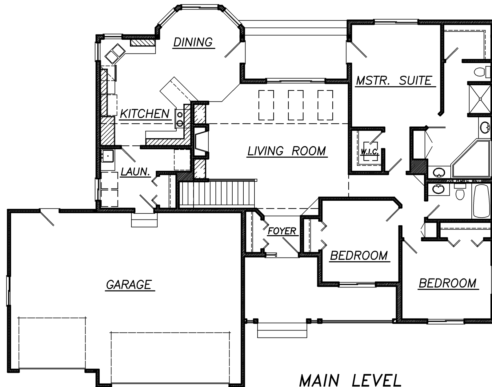
MAIN LEVEL 1600 SQ.FT.